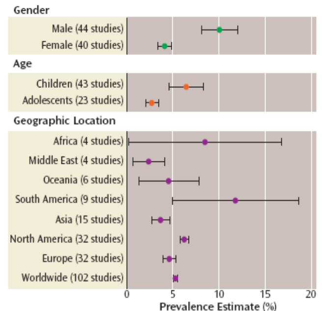
FIGURE 2. ADHD/HD Pooled Prevalence According to Demographic Characteristics and Geographic Location

Kat Belendiuk Clinical and Developmental Psychology Graduate Student